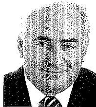
Dominique Strauss-Kahn Managing Director, IMF

Mr. Lamy holds degrees from the Paris based Ecole Nationale Supérieure des Sciences Économiques (HEC), from the Institut d'Études Politiques (IEP) de Paris (ENA). He began his career in the French Ministry of Finance and at the Treasury. He then served as Deputy Minister Jacques Delors and subsequently to Prime Minister Lionel Jospin.