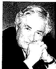
James D. Wolfensohn Co-Chair, Bretton Wood Committee