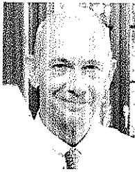
Pascal Lamy Director-General, WTO

Pascal Lamy has been the Director-General of the WTO since September 2005.