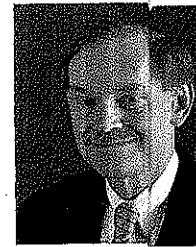
Robert Zoellick President, World Bank

Prior to taking up his position at the IMF, Mr. Strauss-Kahn served as Deputy Managing Director of the National Assembly and Professor of Economics at the University of Paris. He was reelected three times to the National Assembly. He ran for the Socialist Party's nomination for the French Presidency in 2007. He taught economics at the Institut d'Études Politiques de Paris and was a professor at Stanford University. He was also a personal advisor to President Nicolas Sarkozy.