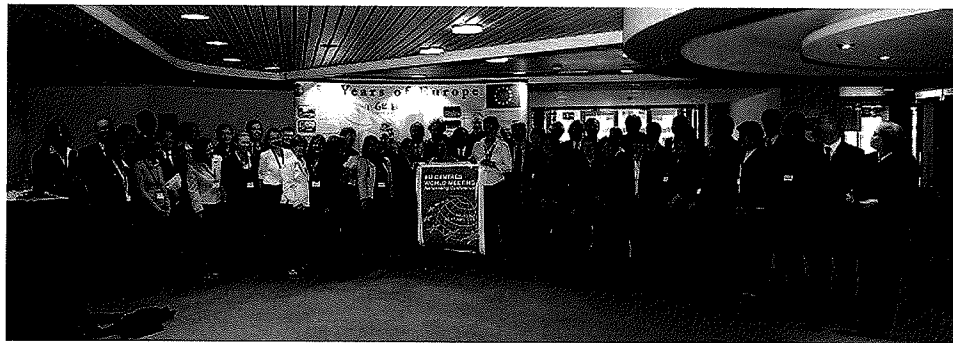
Photo: This past April, staff from the EUCE traveled to Brussels to participate in the first meeting of the World Network of EU Centers, an event organized by the European Commission to highlight the global reach of the centers and to foster greater collaboration between centers in different nations.

The past decade has not only seen the growth of EU studies locally, but also the development of a much broader EU Centers program in North America and globally. One of ten original US centers, the UW's EUCE is now part of a world network of 22 centers at universities in the US, Canada, Australia, New Zealand, Japan, South Korea and Singapore. New centers will also open soon in Hong Kong and Taiwan. The EU Center of Excellence of Seattle looks forward to continuing its work at the UW and in the Pacific Northwest over the next three years, while also building deeper collaborative ties with its partner centers across the country and around the world.